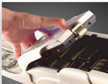
Easy opening bill path for jam removing and easy maintenance.

NC-1100 is designed to overcome manual feeding authentication device by automatically feeding paper lengthwise. With it's battery powered, 2.6 lbs light weight and compact footprint, you can fold and carry it anywhere on the cash processing site.