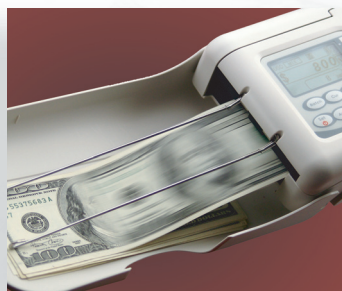
NC-1100 in action