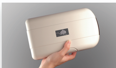
Portable, foldable and built-in battery option.