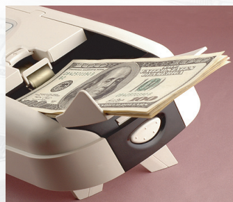
Inclined design. Notes can be aligned evenly and auto feeding.